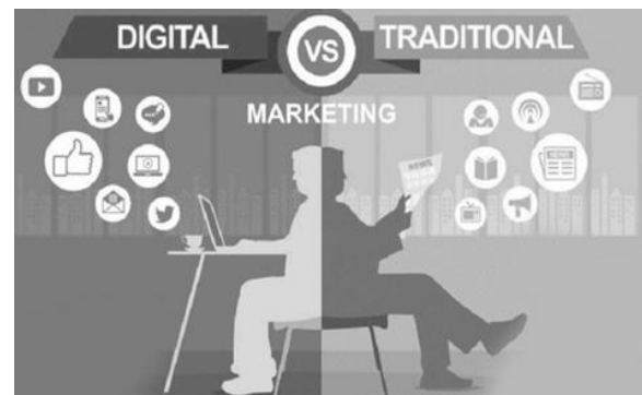
Figure3. Platform of Digital Marketing vs Offline Marketing

In digital marketing, the company can make the target on various kinds of platforms such as Social Media, SEO, PPC, Google ads, etc. While Offline marketing can make target some markets, to prepare a new and old client list, to catch up with luxury brands or markets. It is a long process and to