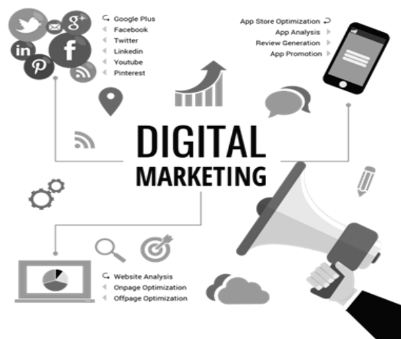
Figure1. Digital Marketing

technologies such as mobile commerce, electronic funds transfer, supply chain management, Internet marketing, online transaction processing, electronic data interchange (EDI), inventory management systems, and automated data collections system. Nowadays, Digital Marketing plays a huge and important role in marketing. Digital Marketing is a fast process, less physically power efforts and time-consuming. e-Commerce can provide multiple comfortable zones to the customers in the form of availability of goods at a lower cost, wider choice and saves time. Ecommerce is showing enormously business growth in India. Customer feedback can play a major role in both marketing Digital Marketing and Offline Marketing. The success or best result of Digital Marketing is depending upon its popularity of e-Commerce customers, its branding images, its unique and fair policies of e-Commerce sites and customer relations, etc. Digital marketing is simple procedures and a friendly user than Offline marketing.