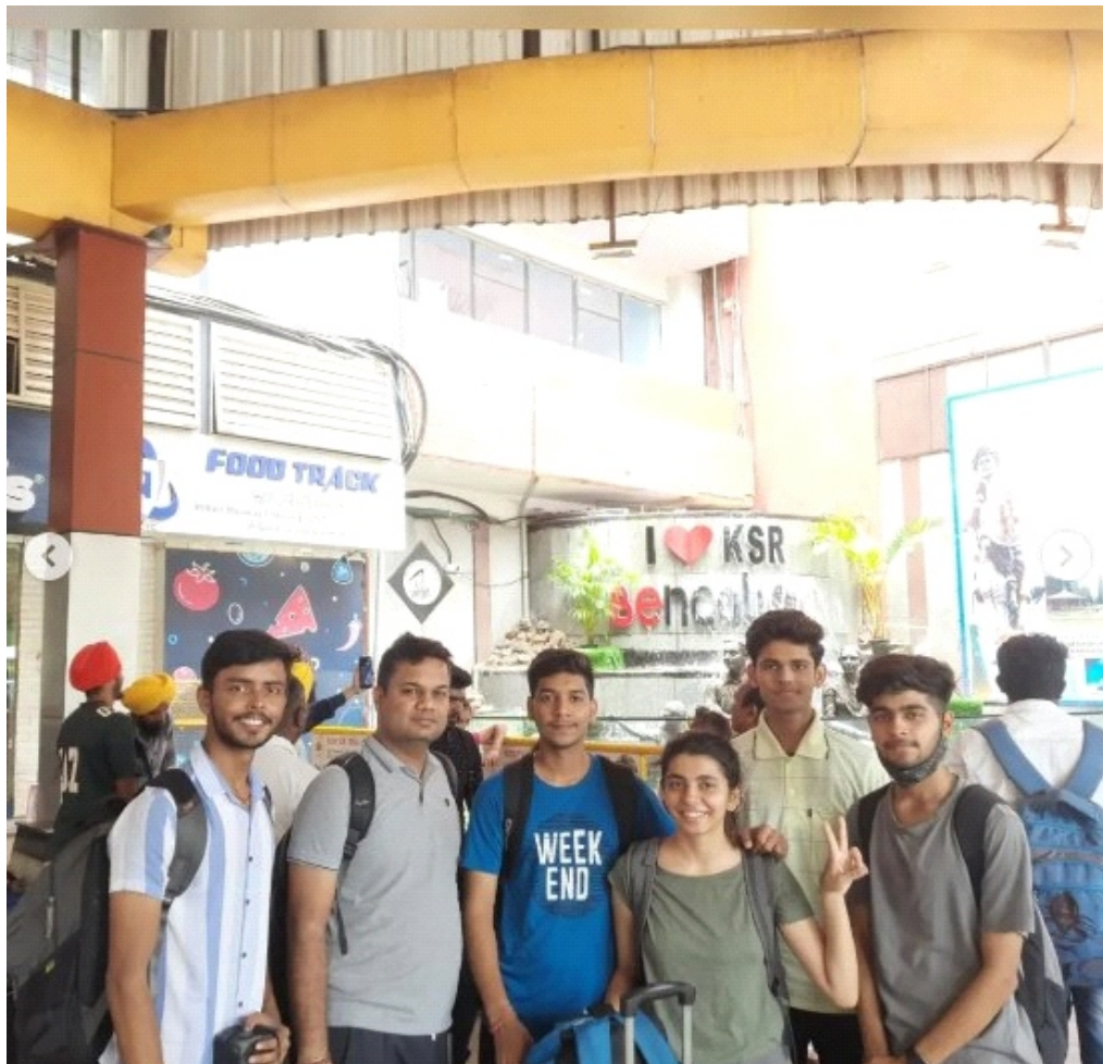
Team name: The Spartans1